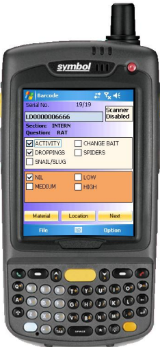
ServicePRO-OnLine Bar Coding on a Symbol MC70/75